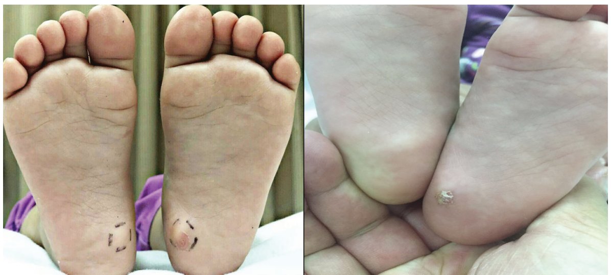
Figure 1. Solitary bilateral skin colored soft mobile sub-cutaneous nodules (1x1cm in left foot and 0.5x0.3cm in right foot). Left foot showing site of biopsy after suture removal.

A 14-month-old healthy full-term girl born to consanguineous parents and a product of normal spontaneous vaginal delivery following an uncomplicated pregnancy presented to the dermatology clinic with her parents who were concerned about an asymptomatic swelling noticed in her heels bilaterally since birth. The swelling was not associated with pain, itching, discomfort,