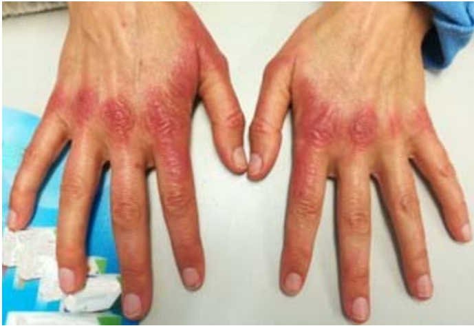
Figure 1. Dermatomyositis: characteristic erythematous flat-topped papules over metacarpophalangeal and proximal interphalangeal joints. These lesions emerged 6 weeks after the beginning of cytotoxic treatment.

A 35-year-old premenopausal woman presented with a palpable nodule in her left breast on self-examination. She had no personal or family history of known diseases. Mammography and mammary