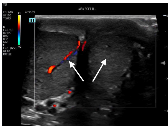
Image 1. Side-by-side view of initial testicular assessment using point-of-care ultrasound. The testicle on the image-right corresponds to the patient's painful left testicle which was found to be enlarged with surrounding edema and absent Doppler flow. Arrows highlight presence of flow in unaffected testicle and absence of flow in affected testicle.

Testicular torsion is a urologic emergency in which the testicle rotates 180-720 degrees, compromising venous and ultimately arterial circulation, leading to ischemia, necrosis, and nonviability. The literature has demonstrated good survivability at six hours, although it is time dependent with improved outcomes at quicker intervention. 1 Classic history and exam features include sudden onset of pain, and a firm, horizontally oriented testicle with absent cremasteric reflex. 2 Conventional