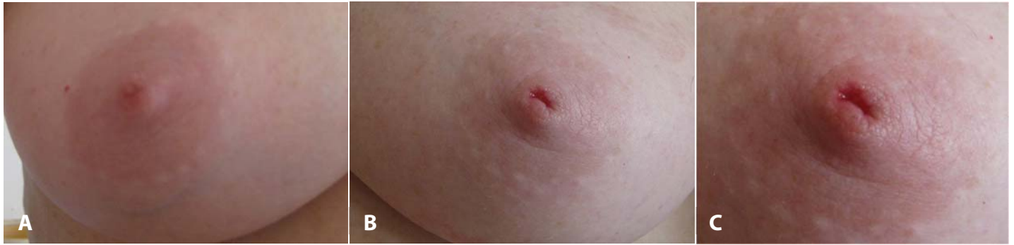
Figure 1. A) Right, unaffected, breast. B) Left breast showing only small fissure in the nipple but no other changes to the nipple and areola. C) An enlarged view of the left nipple—observe the small fissure in the nipple and a droplet of clear fluid in the upper corner.

As the patient is seldom seen by the breast specialist at the outset, cancer treatment is often delayed. It can take several months before Paget disease of the breast is correctly diagnosed.