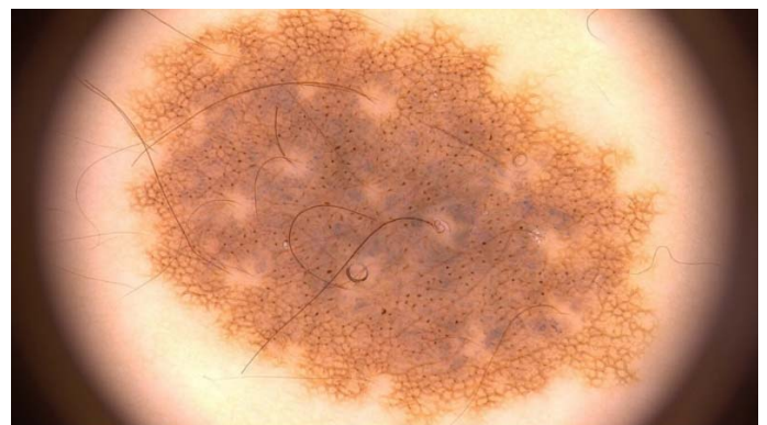
Figure 3. Dermatoscopy showing two circle hairs partially embedded within a congenital melanocytic nevus.

Circle hairs are usually discovered on the torso (back, chest, shoulders, abdomen) and thighs of overweight hairy elderly male patients [1, 3-5, 7, 11]. Buttocks and upper limbs may also be involved [2, 5]. A similar disorder affecting the eyelashes (circle lash) has been reported [12]. CH are usually interspersed among normal straight hairs as perfect rings or circles embedded in stratum corneum [1, 3-5]. Tightly twisted hair shafts form round loops under a thin skin layer and by dermatoscopy, they are visualized as dark concentric rings or circles next to hair follicle ostia [2, 4, 11]. In our first case, a dilated hair follicle ostium and the perfect circling of hair underneath the skin led to a 'stone ring-like' appearance. Whole or part of CH may protrude out of the skin [1, 2]. Hair can easily be extracted after