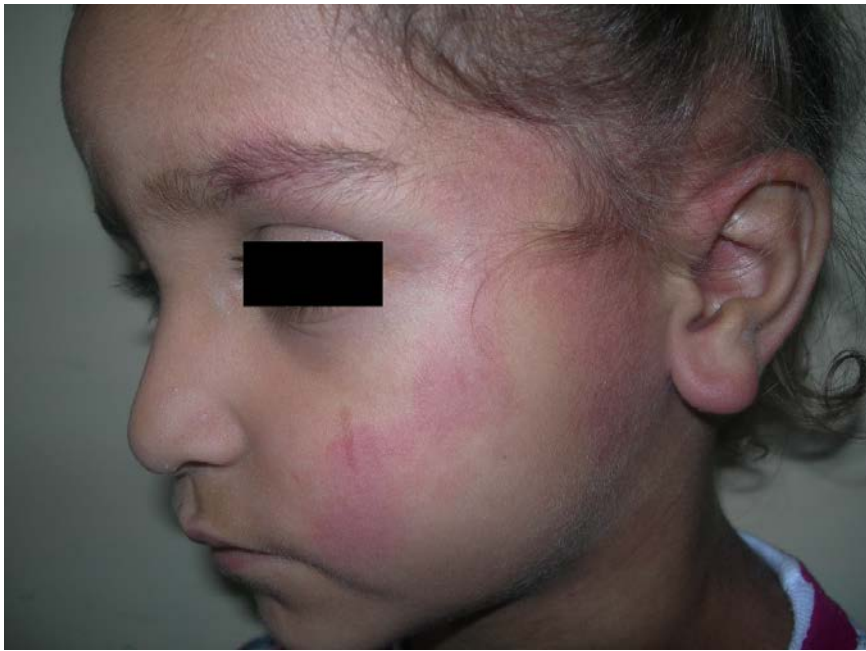
Figure 5. Erythematous patches

On muco-cutaneous examination, the patient had extensive, irregular, deep red, reticulated macules and patches on the left side of the face along the ophthalmic branch of trigeminal nerve, chest, back, buttocks, penis, scrotum, arms, hands, and left leg (Figure 5). Multiple, ill-defined, large, blue-brownish spots suggestive of dermal melanocytosis in a patchy pattern with no midline demarcation were present over whole of the abdomen, back, and buttocks.