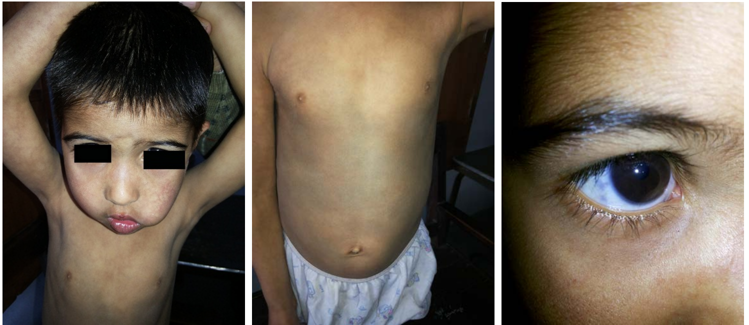
Figures 1, 2, and 3.

On muco-cutaneous examination, bilaterally symmetrical reticulated erythematous marble-like macules were present on his face, mainly the cheeks and eyelids, upper arms, and calves (Figure 1). There were also a few well-demarcated large greyish-blue hyperpigmented spots in a patchy pattern without midline separation present over whole of the trunk extending up to the thighs (Figure 2). Anthropometric measurements were symmetrical with no atrophy or hypertrophy of soft tissue. The urethral opening was located ectopically on the ventral surface of glans penis along with a dorsal hooded prepuce (Figure 3).