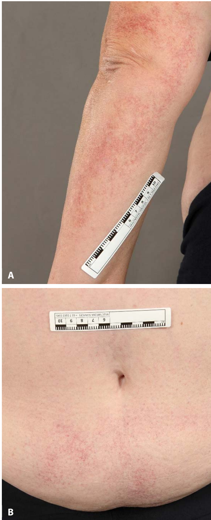
Figure 1. Clinical presentation of cutaneous collagenous vasculopathy. Erythematous, mottled, telangiectatic macules involving A) the upper extremities, and B) abdomen.

erythematous, mottled, telangiectatic macules on the upper extremities and abdomen ( Figure 1 ).