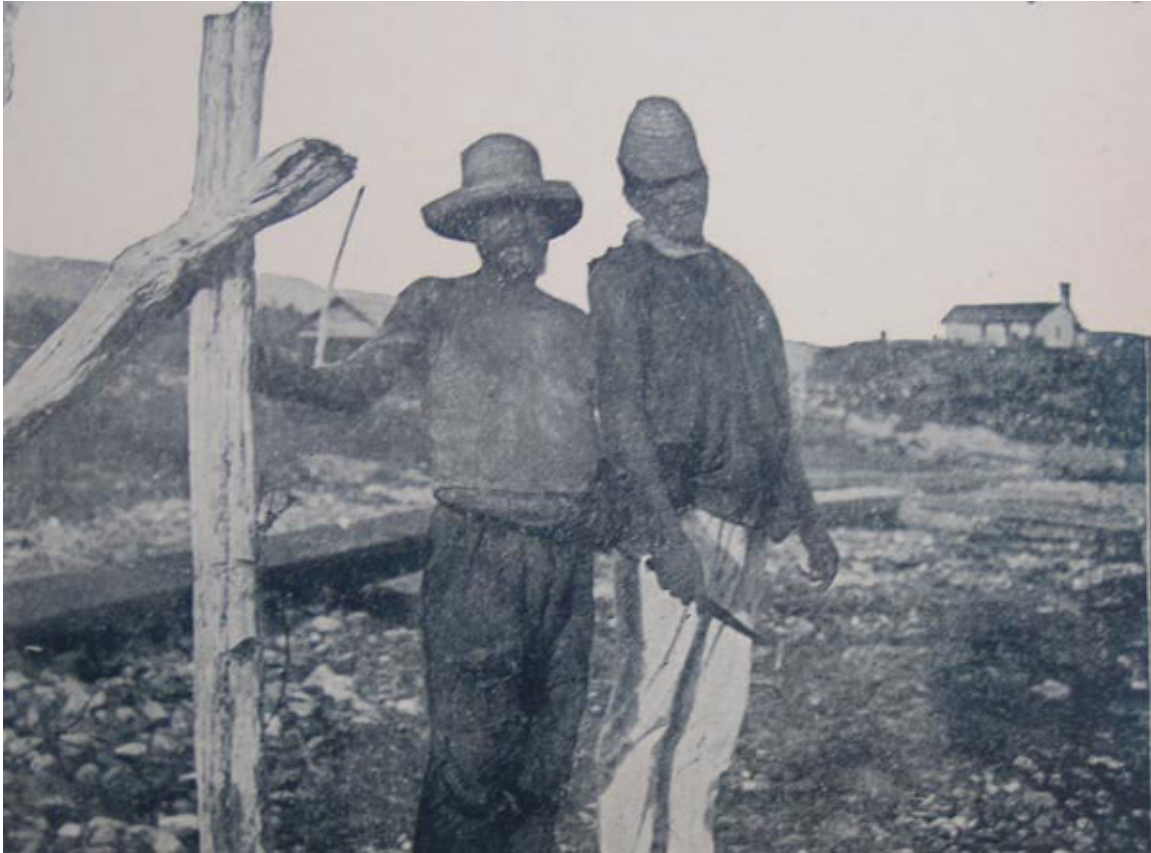
“Two Gentlemen of Cuba—The First Met,” from Burr McIntosh’s The Little I Saw of Cuba (1899).

In 1896, Crane wrote a series of sketches on the downtown Manhattan neighborhood known as the Tenderloin for Hearst’s New York Journal . The sketches treat everyday life in the vice district, whose boundaries extended from 14th Street north to 42nd Street and from genteel Murray Hill west to Seventh Avenue. The heart of the Tenderloin was the 29th police precinct, which Buel described in 1883 in the terms of the wild frontier of mid-century, reflecting the fear that New York’s (and the nation’s) presumed modernity was still perilously incomplete: “California in the worst days of ‘49 to ‘56, was a sovereign millennium compared with the civilization of such places as Baxter, Water, and Bleecker Streets of Gotham, or in the district bounded by Fourteenth and Twenty-Second streets and Fourth and Seventh Avenues, known as the Twenty-Ninth precinct.” 23 The wave of reform in 1890s New York, however, began to address some of these signs of “backwardness,” and by the time Crane began his Journal series, the Tenderloin was already changing. After the election of a Republican mayor briefly displaced Tammany Hall Democrats in 1894, Theodore Roosevelt was appointed chief of the New York Police Department with a reform mandate. Roosevelt reorganized the department along paramilitary lines to combat corruption and political clientelism, its two most notorious problems under the