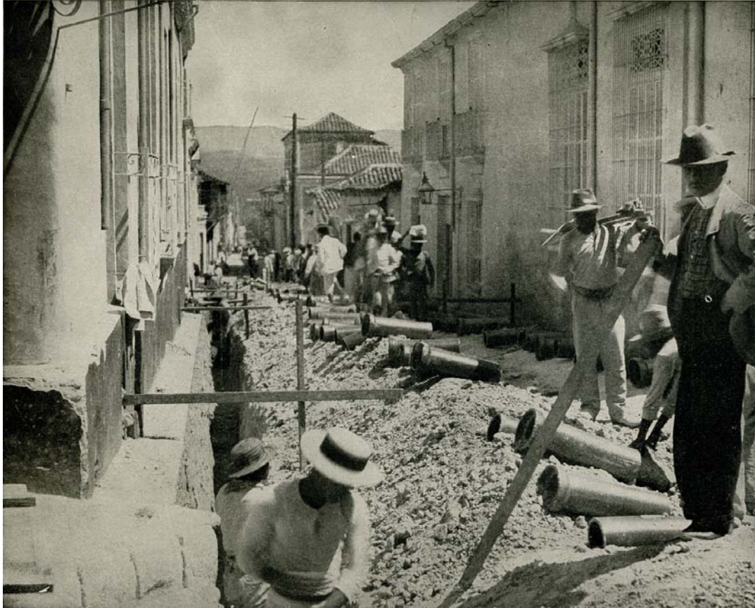
“Laying Drain Pipes in Santiago,” from Olívares’s Our Islands and Their Peoples (1899).

When “reform” became militarized as an administrative and political instrument of the state, it became easily exportable as an object of imperial military expansion. The militarization of the police and the public works brigades promoted them as impartial instruments of the public good and democratic governance, and the soldierly posture of the newspaper correspondent in suffering Cuba gave a narrative form to the military ethic of reform. Just as the paramilitary policing of the slum was for Riis primarily concerned with securing the rights of citizenship for the poor, the correspondent in Cuba often saw his role in similar terms. As the war with the slum yielded to an imperial adventure on foreign soil—in some cases, new wars with Cuban slums—the tasks of policing the internal other and organizing the disordered spaces of the tenement were similarly transferred abroad. And when the war with the slum went to Cuba, Stephen Crane followed it.