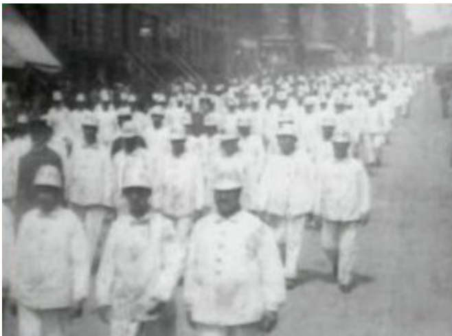
White Wings on Review (Thomas A. Edison, Inc., 1903).

New York's White Wings march in formation down Fifth Avenue in April 1903.