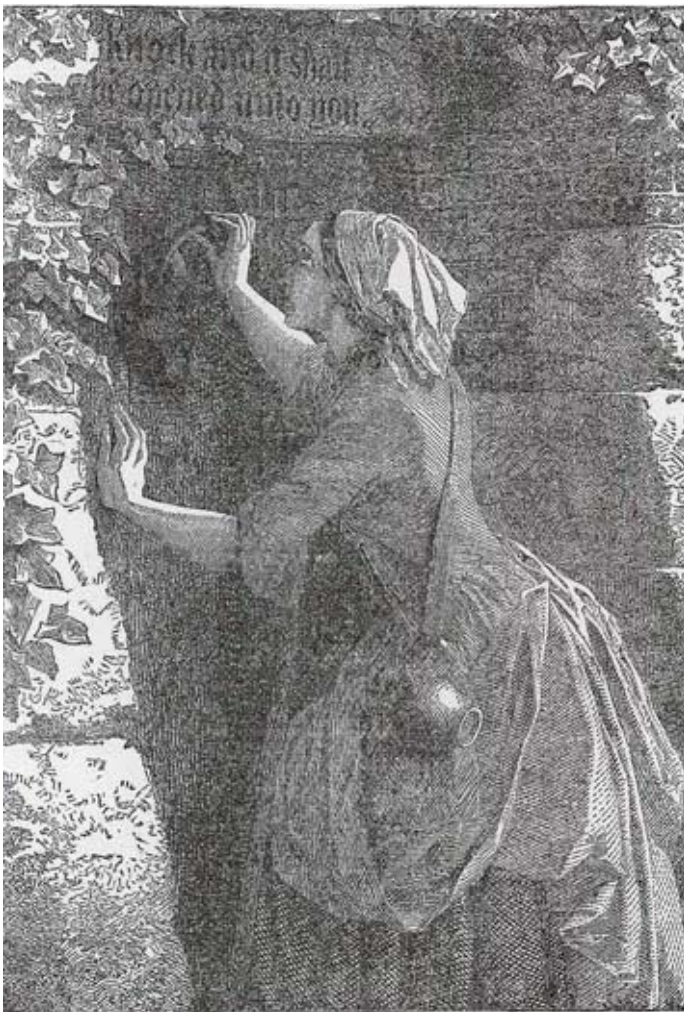
WHAT SHALL HER PORTION BE ?