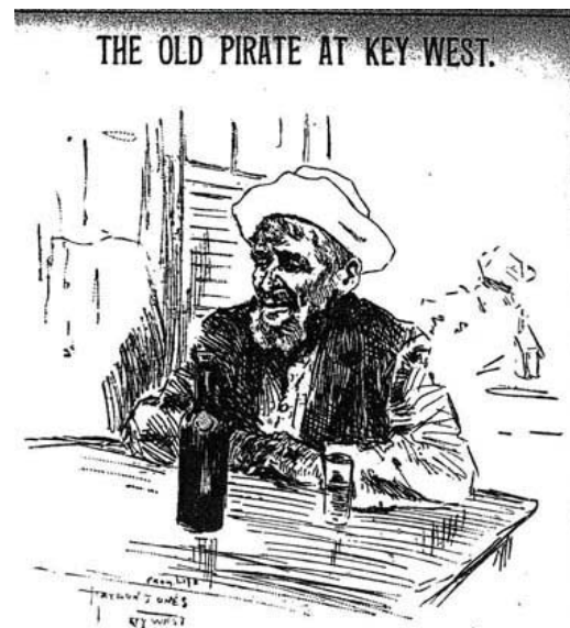
Sketched by a staff artist of The World while the pirate was listening to an interesting story told by Stephen Crane.

The reporter becomes the story—in this cartoon even a pirate, normally the source of interesting tales, instead sits fascinated by the stories of Crane’s adventures.