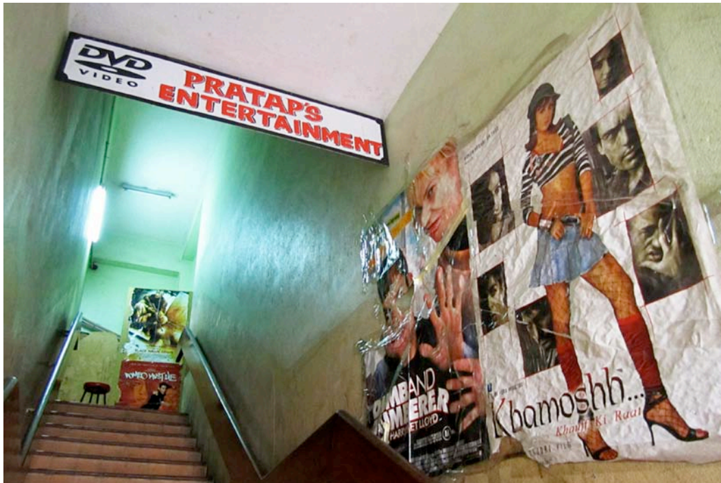
Figure 7. Pratap's Entertainment carries both Bollywood and Hollywood titles

with one another. In browsing the selections, I have found both softcore erotic films and queer films mixed in with science documentaries and cartoons. At times DVD cases are not on display, spatially demarcating their differences, but rather, customers flip through a large binder with copied DVD covers (in some places DVDs can be made to order). The interior of the store, like the integration of DVDs into the broader commercial landscape, facilitates a browsing across genres and between different kinds of objects.