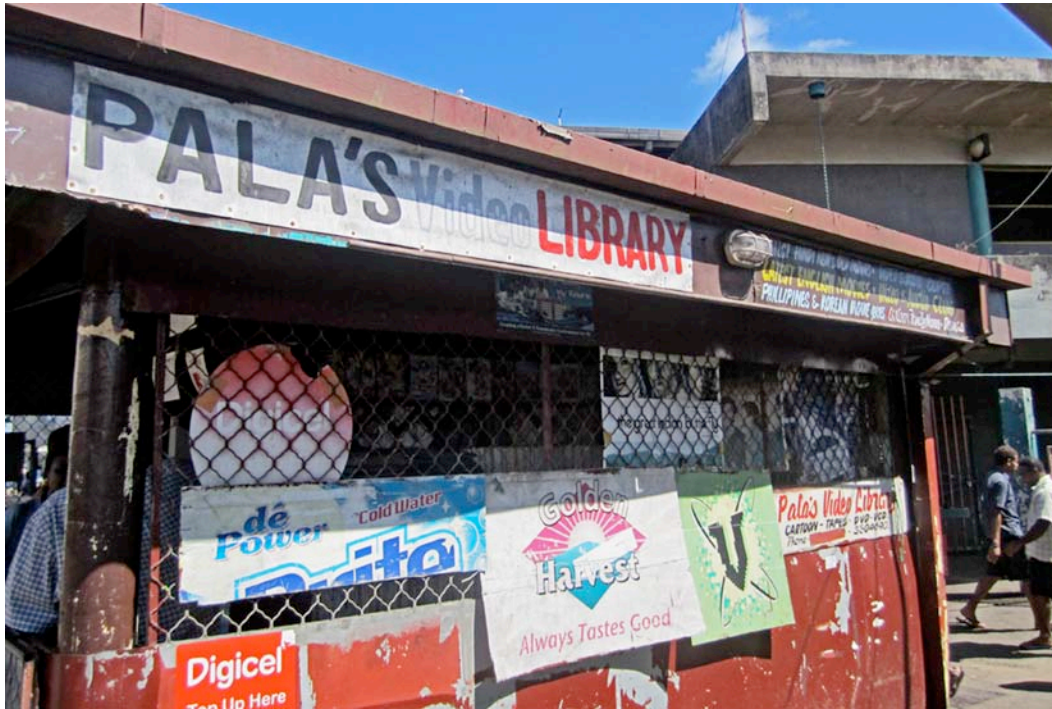
Figure 3. A DVD hut centrally located near the Suva market

The embrace of video takes on more significance when one considers that television was not available in Fiji until almost a decade later, in part due to a political coup in 1987 and the government's worries about external cultural influences. Video was a more 'mobile' technology whose circulation was less expensive than the development of a national broadcast infrastructure. Therefore, in the 1980s, television in Fiji was imagined in relation to video, rather than the other way around. The government considered setting up solar powered TV sets in rural villages and screening videotapes that were prepackaged and sent out from Suva (an alternative kind of broadcasting). 4 The country's annual report in 1981 suggests that video circulation might form the foundation for television development since "'television' already exists in Fiji in the form of the growing number of video recorders and accompanying facilities" and the growth of this industry offers an opportunity "to provide basic training skills ... for a national broadcast television service." 5 It was in this period, before satellite and broadcast TV began, that the video centre came to occupy a central function in Fiji's media landscape not only for the distribution of foreign film and television, but also for national media production.