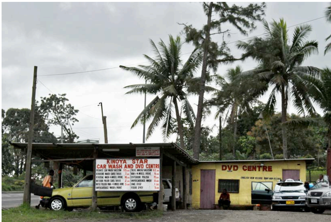
Figure 1. At the Kinoya Star Car Wash and DVD Centre, you can buy a car wash for $3.00 and a DVD for $1.50