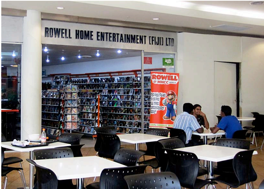
Figure 6. The owners of Rowell Home Entertainment, a DVD store that imports non-pirated films, have complained about the competition from stores that sell illegal DVDs

Almost all of these stores sell movies, though several rent out discs as well. Copies can be purchased for around $2 or $3 FJD ($1 USD), making them accessible even to lower income families. 6 The selection is a mix of recent Hollywood releases, Bollywood movies, soap operas from the Philippines, Gospel, Korean, and other East Asian films. To some degree, the stores reflect Fiji's multi-ethnic society, with indigenous Fijians (many of whom are Methodist) comprising just over 50 percent of the population and Indo-Fijians (Indians were brought over as indentured laborers during the colonial period) comprising around 40 percent. Since Fijian culture revolves around family and gatherings at home, it is not surprising that children's movies occupy much store space and that, more broadly, the practice of home DVD viewing is so widespread. Some stores, especially those that only sell DVDs, establish a specialization and carry a majority of American or Indian film, with different sections for each genre. In many stores, however, an array of different kinds of films are available and genres are intermingled