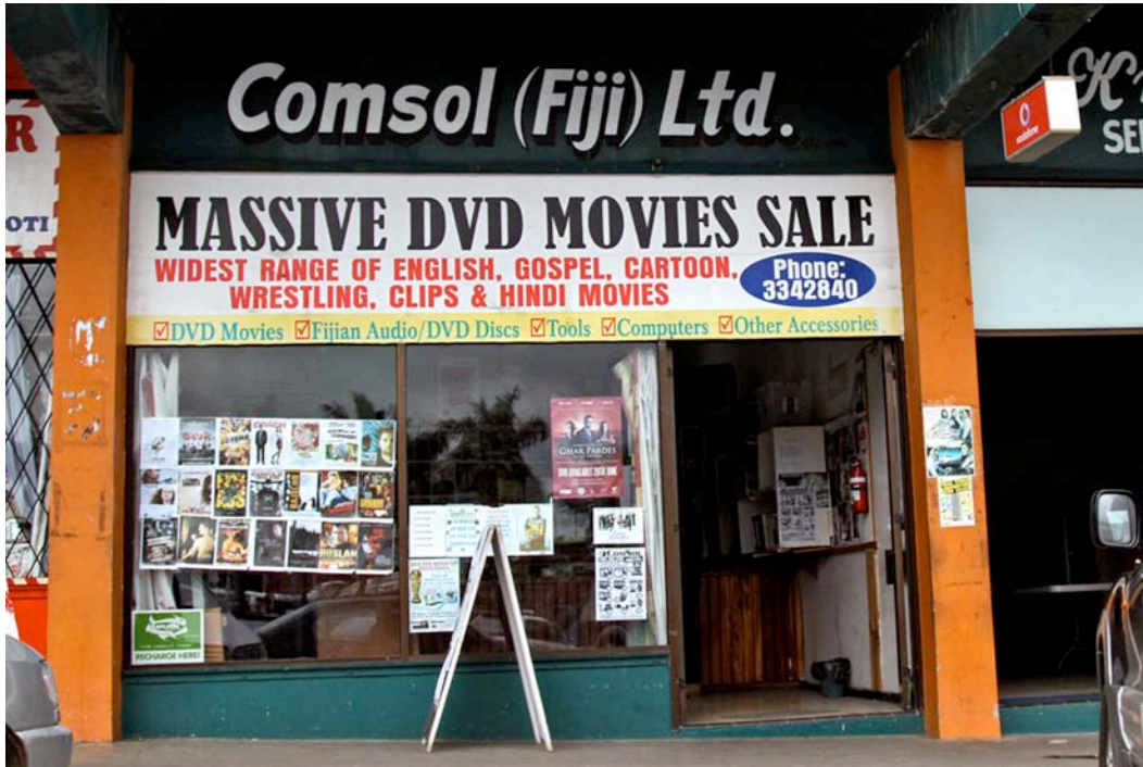
Figure 2. Comsol (Fiji) Ltd. is a local chain that sells DVDs as well as a variety of household items

Before DVDs, many stores in Suva sold VCDs and videotapes (some still do). Fiji's DVD industry, like many others, can be traced back to the emergence of the video store industry in the mid 1980s. By this time, Fiji had an estimated 30,000-40,000 video players and a growing video store market. 1 This equated to about one video player for every twenty people—a rapid spread considering that telephone density had reached this level only five years before (and subsequent to several decades of development). 2 The Fijian government embraced video technology: they set up the Fiji National Video Centre, sent their technicians for training in video production, and launched a vigorous audiovisual program on video. 3