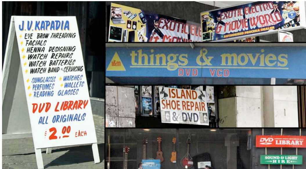
Figure 5. DVD store signs in Suva

latest releases). Though the development of digital networks has in some places dislocated the circulation of audiovisual media away from the DVD store, in Fiji, the low penetration of high-speed Internet access, coupled with enormous international connective capacity, and a history of the video centre as a media distribution infrastructure, has increased the concentration of media exchange in the store itself.