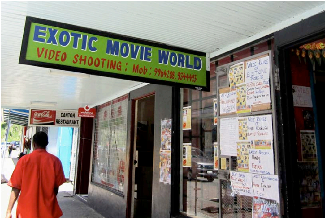
Figure 8. Exotic Movie World

especially given the continuing digital divide between developed and developing countries. Whether Suva's DVD stores remain a dominant cultural form as high bandwidth visual media usage increases and piracy laws are strengthened remains to be seen. Whatever mode of distribution emerges next, however, is likely to be shaped in relation to the topographies of existing cultural landscapes.