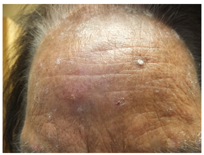
Figure 1. Ofuji disease. Multiple scaly erythematous papules and one pustule coalescing into a larger plaque on the forehead.

On physical exam, her face had an edematous, infiltrated appearance with multiple red-brown scaly papules and plaques admixed with pustules. Her chest had similar perifollicular papules and pustules. Laboratory values were remarkable for IgE of 2079 and complete blood count with 20.9% eosinophils.