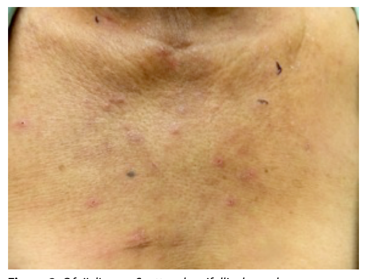
Figure 2. Ofuji disease. Scattered perifollicular scaly erythematous papules and pustules, few with excoriation on the chest. Pen markings indicate biopsy sites.