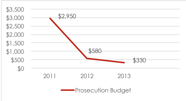
Figure 3: Prosecution budget for criminal cases in Indonesian Attorney General Office

To deal with this problem of backlogs and heavy case loads, law enforcement has begun to evade criminal procedure by creating a “latent regulation” or a “hidden system,” 29 which rushes defendants through indictment, trial, and sentencing, skipping steps along the way and violating criminal procedure law. 30 Under this system, for example, a thievery case under the “ordinary trial procedure” 31 might only proceed for 10 minutes from indictment to verdict. 32 These cases are rushed through the process