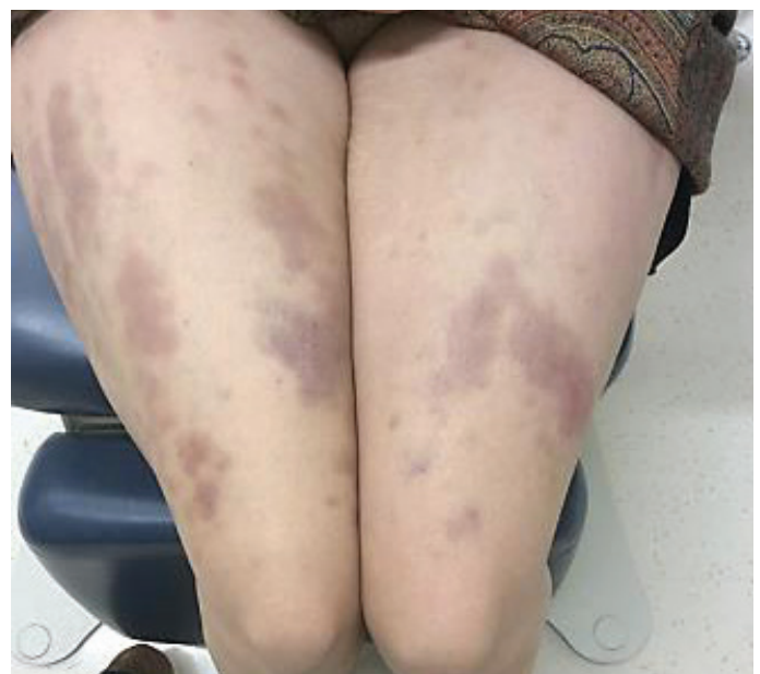
Figure 1. Thighs with multiple, purpuric macules coalescing into plaques with slight yellow-to-orange discoloration surrounding the primary lesions.

abuse, and drug abuse. On review of systems, she had intermittent night sweats but otherwise felt generally healthy. She had never had similar lesions on her skin before. She has a history of obsessive-compulsive disorder that was diagnosed in her teenage years, and she takes fluoxetine, folic acid, biotin, and an oral contraceptive. Two punch biopsies were obtained from the left and right anterior thighs, and she was referred to the Skin and Cancer Unit for follow-up. At her follow-up appointment, she was still developing new lesions on her thighs. She was treated with Sarna lotion. Because of her night sweats for six weeks prior to presentation, she was referred to the Hematology Clinic at Bellevue Hospital Center for workup of an underlying malignant condition. She was evaluated there and found not to have an underlying bleeding disorder or malignant condition.