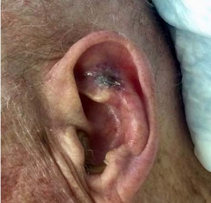
Figure 1. Left scaphoid fossae with an ill-defined slightly scaly grey-black oval plaque; no apparent ulceration.

to demonstrate positive immunoreactivity with melanocytic markers (S100, Melan A), epithelial markers (AE1-AE3, p40), or a vascular marker (CD31). Atypical mitotic figures were few, but a Ki67 stain confirmed the proliferative capacity of the cells to be markedly increased. Thus immunohistochemical stains supported a diagnosis of atypical fibroxanthoma but because the lesion was extensively present at the biopsy base, undifferentiated pleomorphic sarcoma could not be excluded. Two stages of Mohs micrographic surgery were required to completely remove the tumor, with partial cartilage excision to clear the margin. The surgical defect was repaired with a skin graft, and the patient remained disease free at 6-month follow-up.