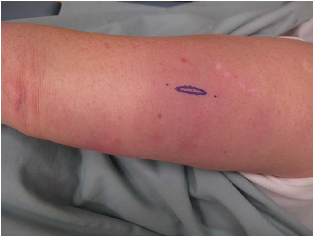
Figure 1. Ill-defined erythematous subcutaneous nodules on the left posterior arm

granulomas in the subcutis with the absence of staining for microorganisms, consistent with subcutaneous sarcoidosis. Initial treatment with oral prednisone lead to disease resolution, but deep nodules returned on the bilateral forearms after medication cessation. She then started hydroxychloroquine 200 milligrams by mouth twice daily with a 50% improvement of her skin lesions at 3-month follow-up. Exam at 6 months demonstrated complete resolution of cutaneous disease, but resolution cannot be solely attributed to hydroxychloroquine because 4-6 weeks prior she had started oral prednisone and was maintained on 5 mg by mouth daily for presumed sarcoidosis-induced hypercalcemia. Upon withdrawal of oral prednisone, however, she has remained free of cutaneous disease for 7 months while continuing hydroxychloroquine 200 milligrams by mouth twice daily.