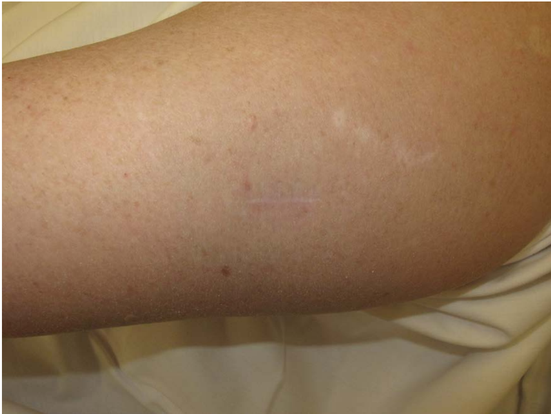
Figure 4. Resolution of cutaneous disease on the left posterior arm after five months of hydroxychloroquine 200 milligrams by mouth twice daily