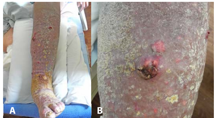
Figure 1. A) Left lower extremity demonstrating a diffuse violaceous, yellow-brown coalescing hyperkeratotic plaques, ulcers, and exophytic violaceous nodules on the anterior and medial surfaces. B) Close-up photograph of the left shin demonstrating an ulcerated, violaceous nodule.

Computed tomography scans of the head, neck, chest, and abdomen/pelvis demonstrated splenomegaly and multiple non-enlarged para-aortic and iliac lymph nodes. A bone marrow biopsy was negative for a hematolymphoid malignancy. A skin biopsy was performed ( Figure 2 ) and found