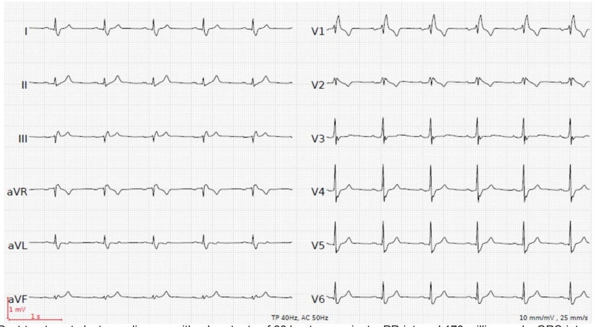
Image 2. Post-treatment electrocardiogram with a heart rate of 66 beats per minute, PR-interval 170 milliseconds, QRS-interval 120 milliseconds. Return to pre-existing right bundle branch block pattern. Potassium level of 6.6 mmol/l.

This case highlights that hyperkalemiainduced muscle weakness with associated electrocardiographic changes may be the only presenting symptom in primary adrenal insufficiency.