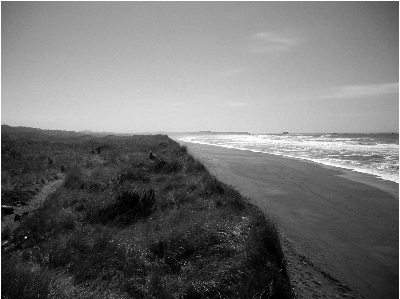
Figure 2. Sweetwater (CA-DNO-335). View to south. The rocky headlands of Point St. George are visible in the right background.

member and field participant Brock Richards as the Sweetwater site (Tushingham 2006:26). A midden area and adjacent circular depression, most likely associated with a semi-subterranean house, is located within the site just north of Sweetwater Creek (Burns and Rhode 2009). If the depression is indeed a house, it may be one of the “several houses and a sweat house” at Sweetwater mentioned by Drucker (1937). This seems quite possible, as this is the only archaeological site in this section of the coast where midden has been recorded, and it is also the only ethnographic camp with houses, according to Drucker (1937).