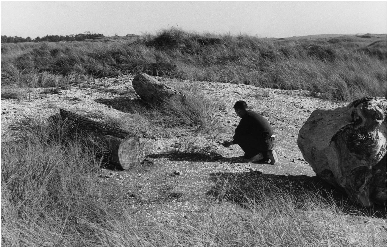
Figure 3. Sweetwater (CA-DNO-22). From Gould's 1964 site survey, courtesy of Richard A. Gould. Richard Gould Archives, California State Parks, Eureka, Cal., Image 333. Photo notes: "Historic Tolowa Indian smelting camp. Note surface erosion and poor preservation of site."

of a very large area used primarily for smelt fishing and shellfish collecting by many generations of Tolowa people. Both contain numerous loci containing mostly concentrations of shellfish, lithics, and/or fire-affected rock. Two areas between the sites each contain approximately 50 "clam" shell fragments (no other cultural materials were observed) that were recorded as isolates by Burns and Rhode (2009). Breaks between and within the sites can be attributed to a number of factors. For instance, the sites may have been used by many different families, who each set up their own discrete camp. The breaks may also relate to differences in site ownership—as described above, at least two villages laid claim to or owned sections of this beach, and ownership shifted over time. The patchy appearance of these sites has also been influenced by the dynamic nature of the sandy dune environment. Natural dune shifting continually exposes and conceals cultural resources, which has led to tremendous year to year variability in site visibility.