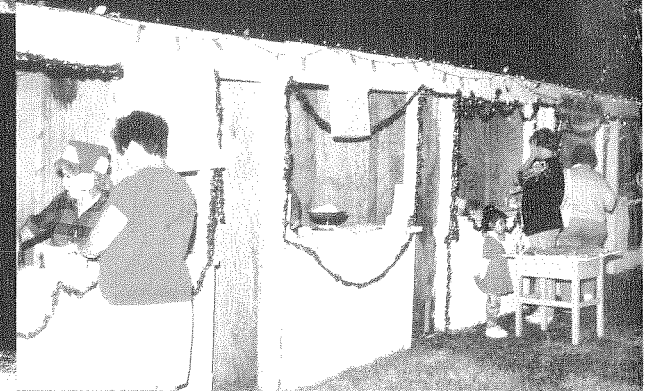
Christmas festival, Padre Pedro Park.