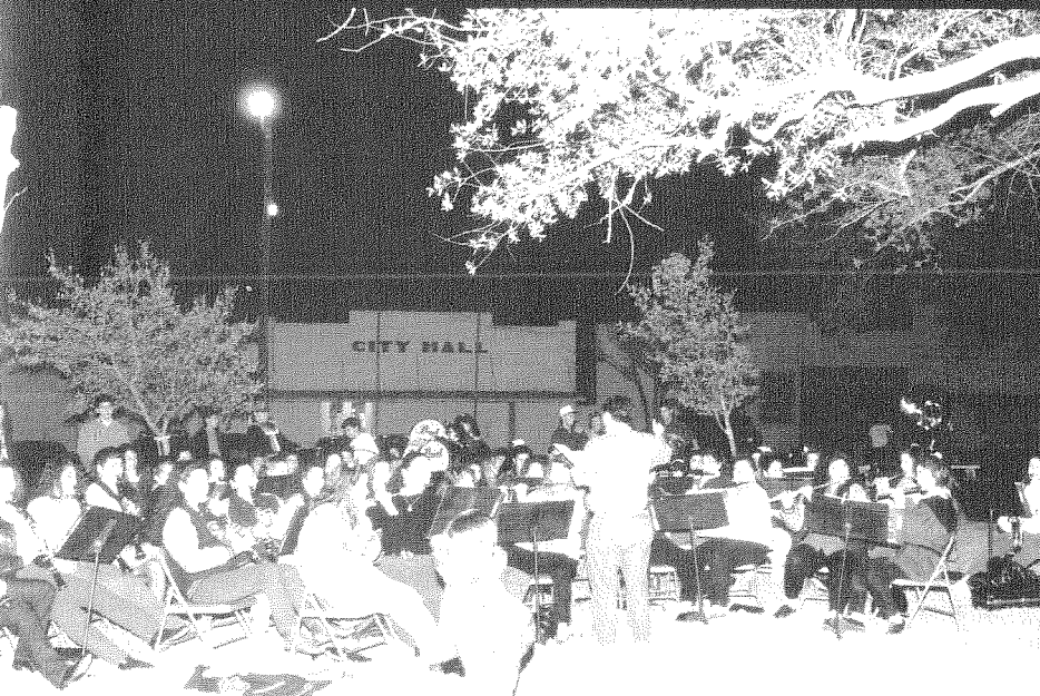
Christmas festival, Padre Pedro Park.