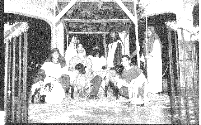
Christmas festival, Padre Pedro Park.