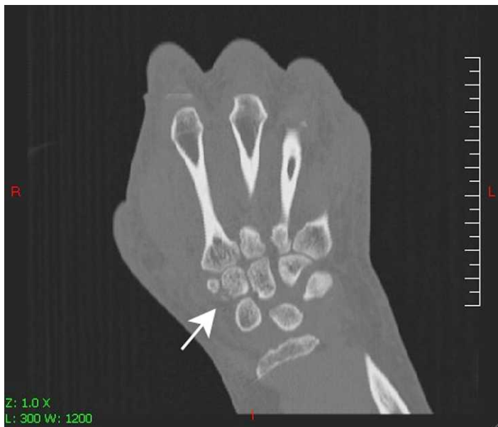
Figure 1. Coronal view computed tomography of wrist demonstrating trapezoid fracture.

second metacarpal. Its position and integrity contribute vitally to the carpal arch, but make detection of injury elusive. 1,2 Fractures are rarely isolated, often involving fractures of the second metacarpal base. 2 Patients may have second metacarpal base tenderness, “snuffbox” tenderness, 3 or pain with axial loading of the second digit 4 after trauma involving an axial or bending force along the second metacarpal. The overlapping bones and intimate articulations of the wrist make plain radiographs difficult to interpret. 1,5 In 2 separate reports reviewing 17 trapezoid fractures, only 1 fracture was diagnosed by plain radiographs; all others required advanced imaging. 6,7 In 1 study, 30% of wrist fractures missed by plain radiograph were diagnosed by computed tomography. 5 Treatment approaches have varied from cast immobilization to open reduction and internal fixation, depending on degree of displacement and integrity of the carpal arch. 1,6 Unrecognized