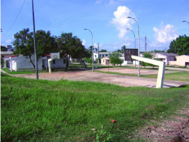
Figure 3: Community building with sports field.

By 2005, Chichi Padron had built more than 160 apartments and houses, the entire neighborhood was connected to electricity, water, and sewage, and the main streets were paved and equipped with streetlights (Republic