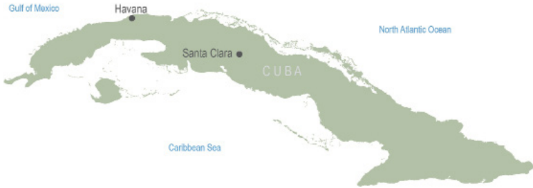
Figure 1: Map of Cuba.