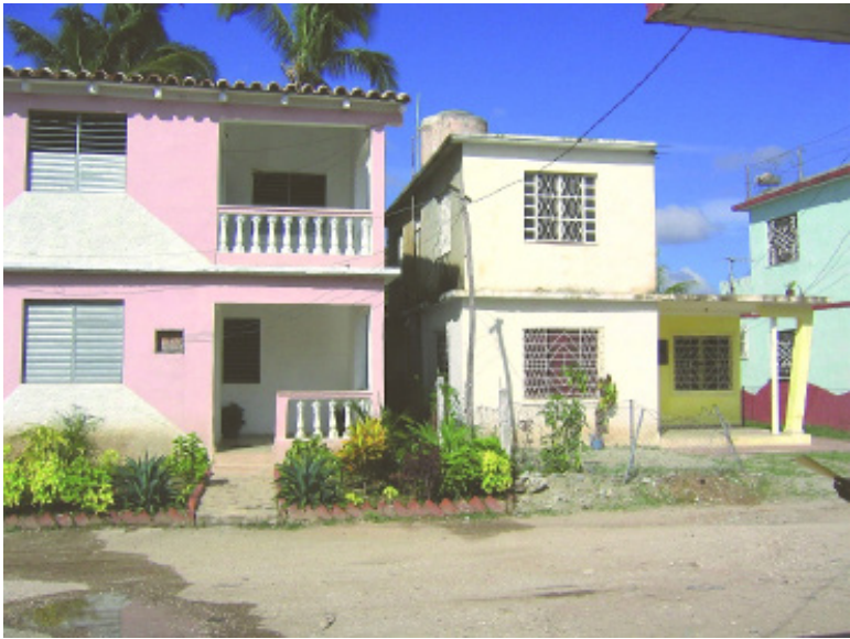
Figure 4: Typical microbrigade houses in Nuevo Condado.

of social activity groups in Santa Clara (Molina, pers. comm.). Another important achievement is the creation of vegetable gardens serving the local food supply. A plethora of small projects are accomplished by groups that organize themselves according to their interests. All these activities have resulted in better nutrition and hygiene, fewer young people dropping out of school early, less unemployment, and fewer criminal offenses, as shown in Figure 5.