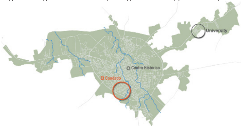
Figure 2: Map of Santa Clara. Credit: Benedikt Brester.

Since the 1950s, Cuba's urban population has been increasing due to migration from the countryside. Up until the 1980s, spontaneous settlements appeared, populated with buildings "made from the most primitive materials" (Rodríguez Gonzáles, pers. comm.). The neighborhood being studied, Nuevo Condado (New Condado), also called Condado Sur (South Condado), has 19,596 inhabitants and a population density of nearly 18,100 people per square mile (Molina 2005) (see Figure 2). It is part of the district El Condado ( The Condado , literally The Shire ), situated in the southwestern part of the city, had separated into two administrative units, Condado Norte (North Condado) and Condado Sur , because it was expanding as a result of migration from the countryside. Condado Sur was neglected by planning institutions, but continued to grow as an informal settlement. From the 1950s to the 1980s, there were almost no governmental housing activities in the neighborhood, due on one hand to the political agendas of the time, and on the other to the district's difficult and complex mix of residents. Many people who settled in Condado Sur were unemployed, poor, illiterate, or former criminals, living in homes lacking family structure. As a result, people from other districts developed a persistent negative image of Condado Sur (Rodríguez Gonzáles, pers. comm.).