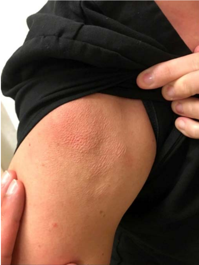
Figure 1. Small, flesh-colored papules of fine wrinkling appearance of the right shoulder. Similar lesions were noted on the left shoulder.