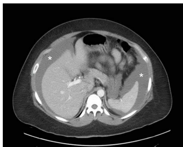
Image 2. Abdominal computed tomography, cross section, demonstrating location of hemoperitoneum (asterisks).