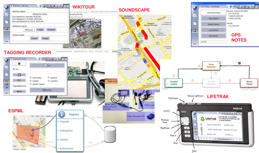
Figure 1: This is a collage of urban sensing applications from CS219 Spring 2006[5]. All of the applications use the Nokia 770 as a platform as well as capture, retrieve, share, and/or interpret sensed information about the user’s environment.

tant and challenging questions, whose answers potentially reach deep into the network architecture.