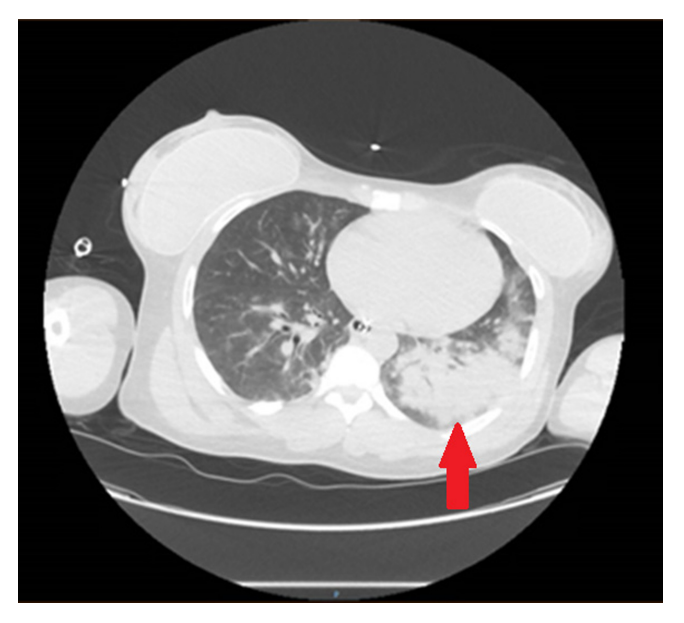
Image 1. Computed tomography of the chest with contrast demonstrating bilateral pulmonary airspace disease, more pronounced in the left lung (arrow).

Initial vitals were notable for tachycardia with a heart rate of 116 beats per minute (bpm), and tachypnea with a respiratory rate of 34 breaths per minute. The patient was also found to be hypoxic at 70% saturation on pulse oximetry. Temperature and blood pressure were 98.3° Fahrenheit and 137/82 millimeters of mercury (mm Hg), respectively. Seizure activity was controlled with 4 milligrams (mg) of lorazepam. The patient remained unable to provide history or follow commands, with continued hypoxia and signs of respiratory distress despite supplemental oxygen with a nonrebreather mask. Due to respiratory failure, rapid sequence intubation was performed. The physical exam was notable for findings suggestive of recent gluteal injections, with surgical pen markings, injection sites, and oozing of clear liquid. After intubation, bloody fluid from the endotracheal tube was suggestive of alveolar hemorrhage.