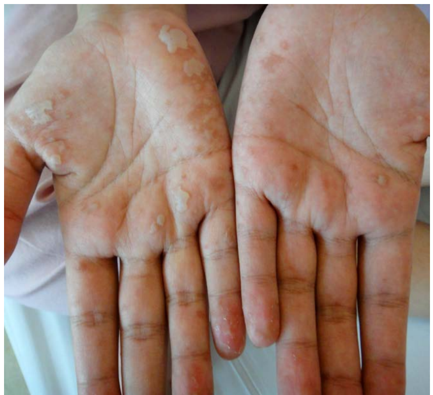
Figure 1. Bullae, erosions and atypical targets on the palms

On examination, the patient was febrile. There were discrete to confluent, dusky purpuric macules, papules, and targetoid lesions, over the forehead, cheeks, neck, and arms. Similar papules and plaques with central bullae were seen on the palms (Figure 1). Erosions were noted on the lips, hard palate, and vulvae. The conjunctivae were normal. The cutaneous lesions affected 3% of her body surface area. Systemic examination was unremarkable except