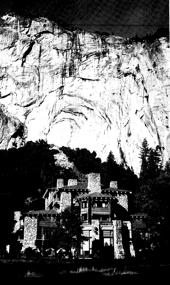
The Ahwahnee Hotel.

detritus of automobiles and campsites? Will we give a valley of natural wonders to succeeding generations or just a series of parking lots?