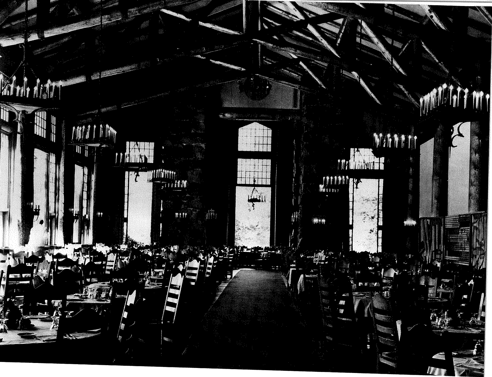
The Ahwahnee Hotel dining room.