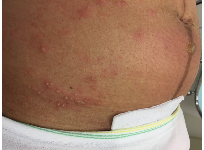
Figure 1. Tense bullae on abdomen in postpartum patient.

Two weeks prior to delivery she reported intense pruritus around her umbilicus, inner thighs, and hands. Initially, there were no skin lesions present, but shortly after delivery she developed blisters on her abdomen. Approximately 5 days after the initial blisters developed, she presented to us again. On exam, she had multiple tense vesicles and bullae on an erythematous base on her abdomen (Figure 1) and medial thighs. Additionally, there were several tense vesicles on her upper and lower extremities.