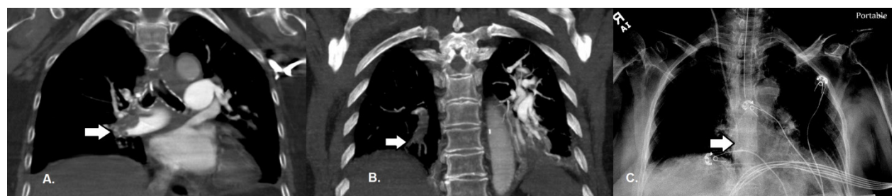
Image 3. Coronal computed tomographic angiography in coronal view with arrows demonstrating A) large right main pulmonary artery, and B) subsegmental pulmonary embolisms; and C) portable chest radiograph showing catheter tip position in the superior vena cava (arrow).

The patient was admitted to the medical intensive care unit for further management. She was discharged home on hospital day 13 at her baseline functional status on oral apixaban.