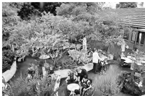
The Sensory Garden at the Lucas Gardens School in Canada Bay, Australia. The image shows several activity rooms and a wheelchair/standing frame table. The banners, windsocks and giant butterflies respond to the breezes, adding movement and color.