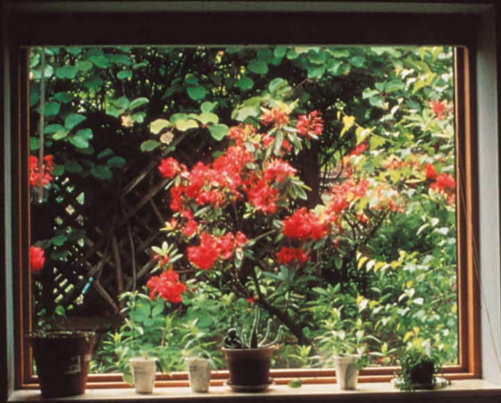
Staff office in a Portland hospice