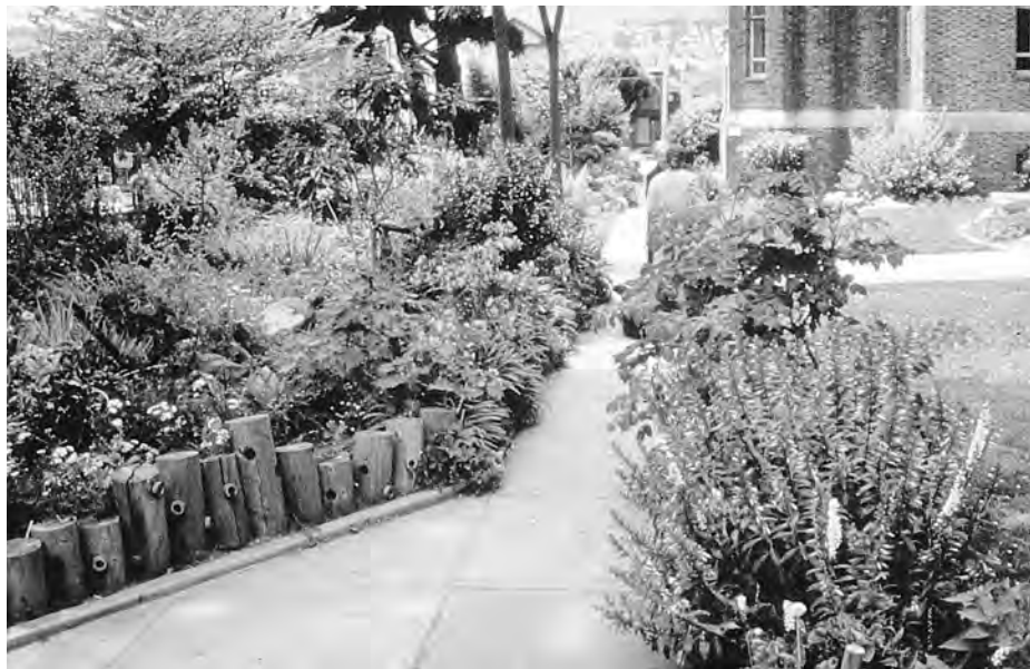
The garden provides a green retreat near the entrance to several busy outpatient clinics.