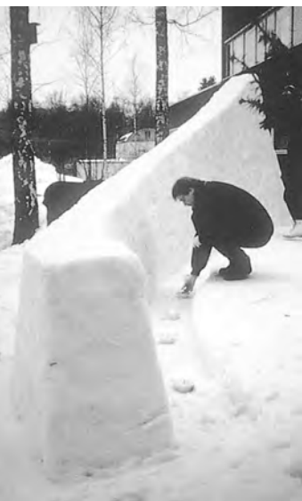
Candles illuminate this snow sculpture outside Hesttoniemi hospital in Taivassalo, Finland, during the long winter nights.

spaces at the earliest stages of a master planning or site selection process. But its methodological rigor is valuable, too, he added: “What many of us architects feel intuitively does not cut it with most of our clients. Healing Gardens provides the necessary scientific framework.”