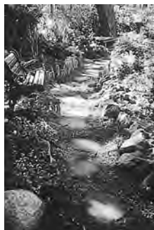
A border of flowering perennials forms a colorful focus, lining a path that leads to the street and a bus stop.