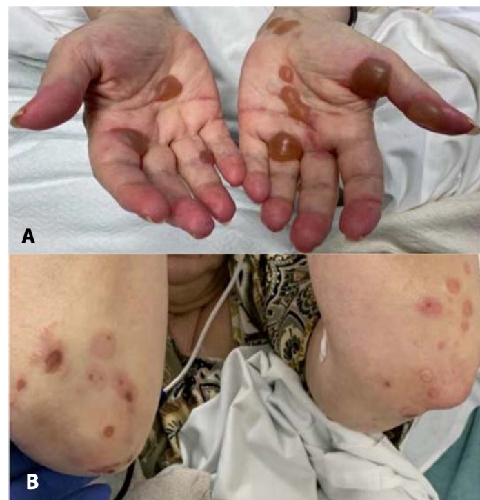
Figure 1. A) Pruritic tense bullae on the palmar hands. B) Flaccid bullae and erosions on bilateral elbows.

taking three doses of anti-PD1 and one dose of anti-CTLA4, the patient developed a widespread pruritic rash with blisters that began on the hands and spread to the trunk and extremities. She also noted associated sores in the mouth, eye irritation, and vomiting. Of note, other medical issues include primary hypertension managed with enalapril. Physical examination revealed pruritic tense bullae on the palmar and dorsal hands ( Figure 1A ), groups of flaccid bullae and erosions on the chest, abdomen, flanks, proximal arms, and elbows ( Figure 1B ), and a