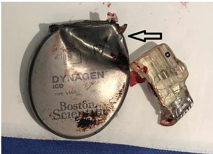
Image 3. Explanted automated implantable cardioverter defibrillator showing damage to the pulse generator (arrow) and separation of the header.

as an additional soft tissue deformity demonstrating an additional GSW (Image 2).