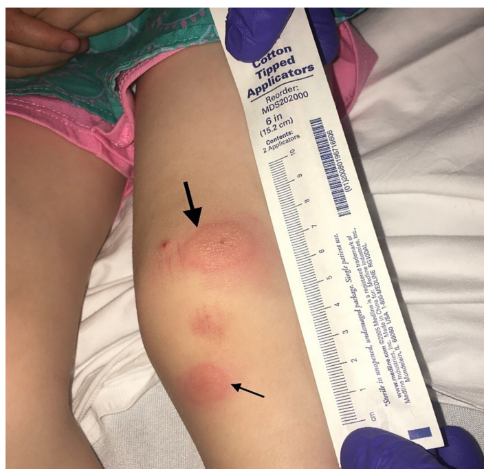
Image 1. The insect bite skin lesions on the knee varying in size (arrows).

A review of the medical literature revealed a single “Images in Clinical Medicine” from the New England Journal of Medicine , which revealed a severe dermatitis of the lower extremities that had similar presentation. 1 No other cases were noted in the literature. The wounds were anesthetized and debrided for concern of a staph infection. The patient was placed on antibiotics and healed uneventfully. The case presented here represents an example of a physical manifestation of Quincke’s sign, not related to aortic insufficiency but to the rarely-noted effect of intense arterial dilatation in the bullous inflammation of the affected subcutaneous area. Quincke’s pulse is a physical finding of aortic insufficiency and, as in this case, focal arterial dilatation. Here, the arterial dilatation in the area of the bite led to an inability of arterioles to maintain sufficient pressure during diastole, resulting in the pulsating blanching and flushing that produced a “blinking” bug bite.