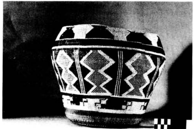
Fig. 1. Side view of Wiyot fancy basket.

The basket is 30 cm. in height and approximately 50 cm. in diameter at its widest point. For warps, the weaver probably used peeled willow ( Salix sp.) shoots, though obviously—