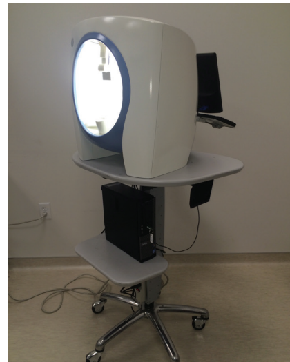
Figure 2. VISIA Facial Imaging Booth.

have been contacted by numerous organizations to lead sun-protection events.