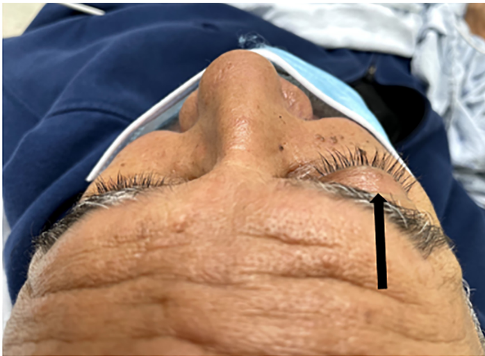
Image 2. Proptosis of the right eye as visualized from above (arrow) in a case of carotid-cavernous fistula.

computed tomography without contrast of the brain revealed mild involutional changes and mild periventricular hypodensities. Asymmetric enlargement of the right superior ophthalmic vein, fat stranding of the right orbit, proptosis of the right globe, and prominence of the right extraocular muscles were also appreciated. Magnetic resonance imaging (MRI) and angiography revealed the right middle meningeal artery merging into the right cavernous sinus, consistent with a cavernous carotid fistula (CCF).