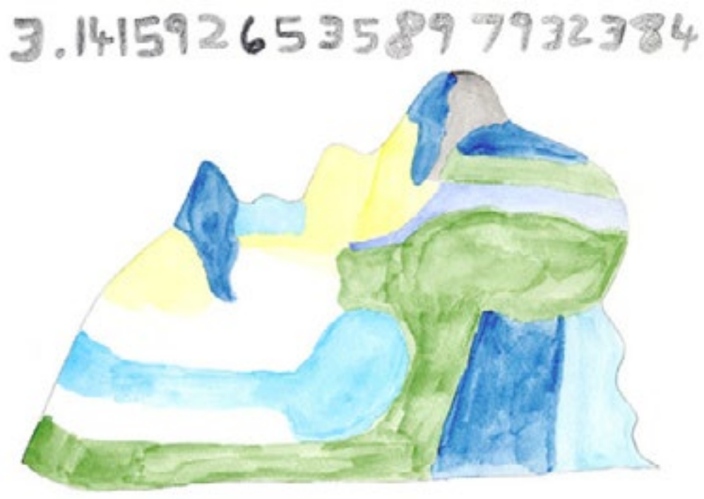
Figure 3. Daniels Tammet’s synaesthetic visualization of the number pi rendered in painting entitled “Pi Landscape.”

proclivity for languages (he knows nine), but appears to have few, if any, social hindrances. Although he was diagnosed with high-functioning Asperger