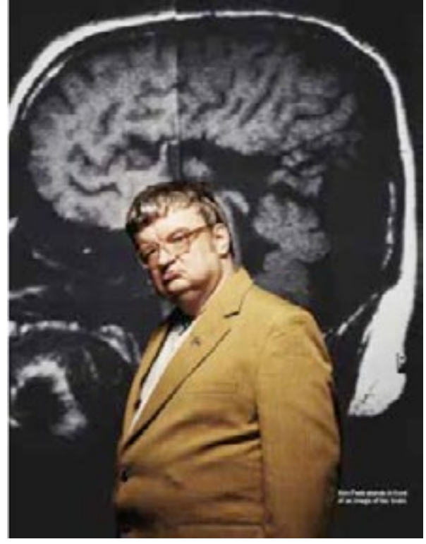
Figure 2. Mega-savant Kim Peek, pictured in front of an MRI of his brain – the black area above his head is where the corpus callosum should be (Treffert 2011)