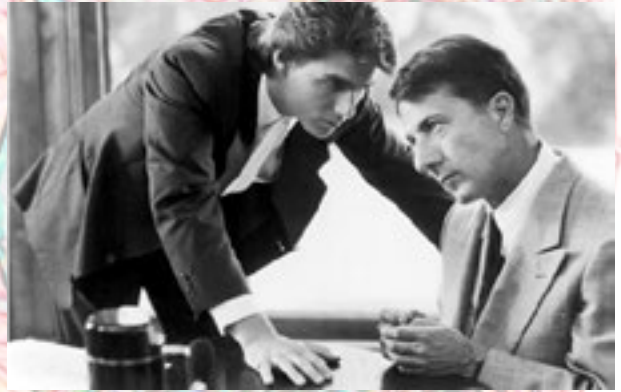
Figure 1. Dustin Hoffman portraying a savant in Rain Man alongside Tom Cruise.