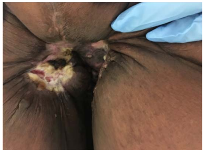
Figure 4. Clinical improvement after excisional biopsy and interferon alfa-2b treatment.

Our case underlines the importance of early and aggressive evaluation of verrucous skin changes in patients with HS. The clinical concern arises from prior case presentations that have shown SCC emerging from chronic inflammation in the