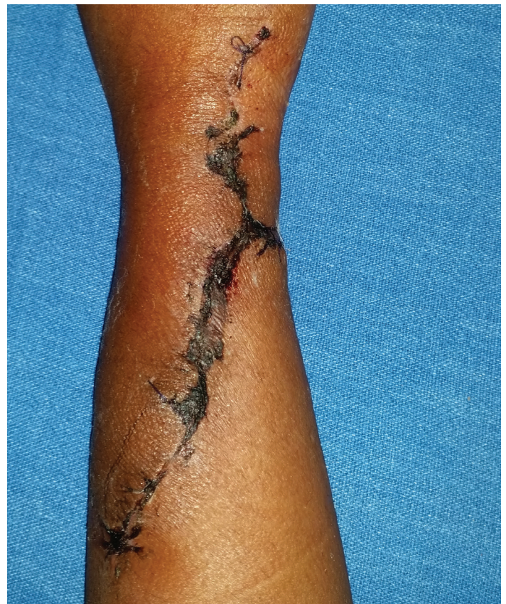
Figure 3. Post operative photography following excision & flap reconstruction surgery.

In a majority of the cases (around 95%), the site of occurrence is the lower extremity and these are mostly