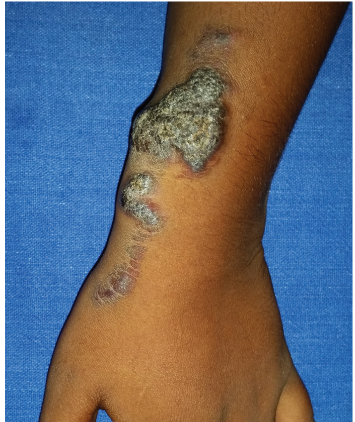
Figure 1. Well-circumscribed, hyperkeratotic, erythematous plaques present in a linear pattern over the medial aspect of the left forearm extending to the hand.

A 7-year-old boy presented with multiple warty