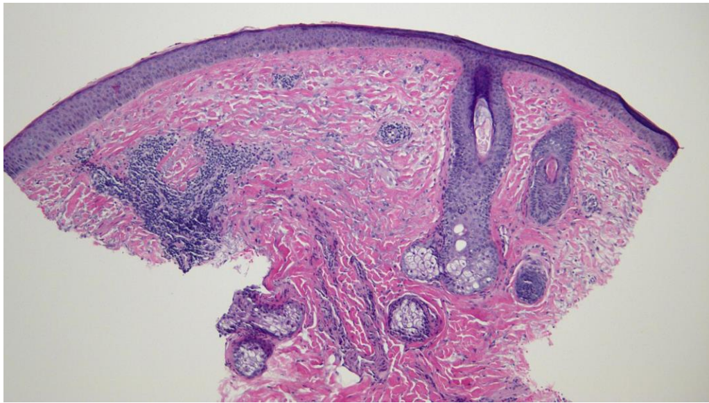
Figure 3. The left cheek punch biopsy shows cells with the appearance of benign lymphocytes around blood vessels in the superficial and mid-dermis (Hematoxylin and eosin; 10x).

Tissue from the left cheek also revealed cells with the appearance of benign lymphocytes around blood vessels in the superficial and mid-dermis (Figure 3).