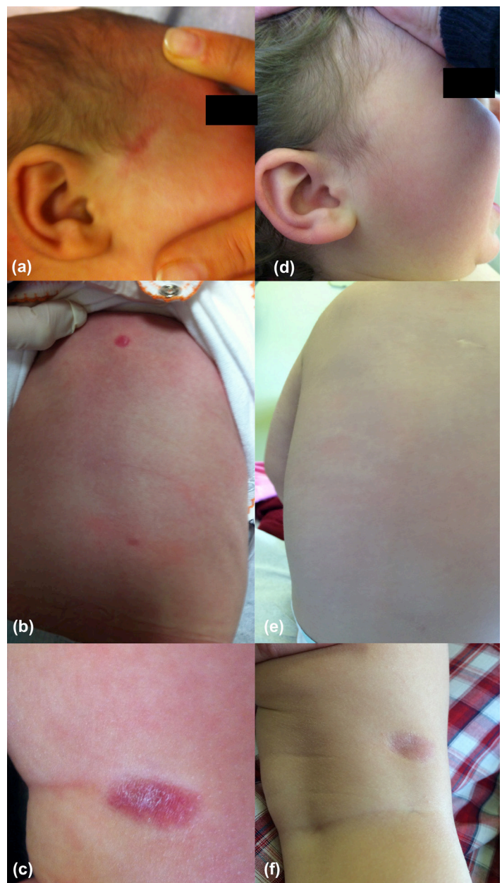
Figure 1. Clinical aspect of the lesions: (A-C) initial lesions; (D-F) regression of the lesions on follow-up visit after 18 months.

A 2-month-old female infant was referred to our department because of the presence of four congenital erythematous-violaceous cutaneous lesions localized on the temporal, dorsal, and lumbar regions,