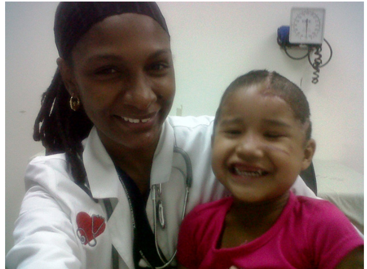
Figure 5. Child in the clinic prior to discharge (published with written parental permission).

A jaguar's typical lifespan in the wild is around 12 to 15 years; in captivity they live up to 23 years. 11 Human population growth inevitably leads to jaguar population decline and eventual local extinction. This stems from deforestation and fragmentation of their habitat with barriers. 6 Both are occurring in the region in which this attack occurred. Jaguars also are killed by ranchers and farmers to protect their livestock or out of fear, and by professional hunters for their skin and other body parts. 6 The jaguar is considered "near threatened" 12 or "endangered," 13 and all commercial trade is prohibited. 14