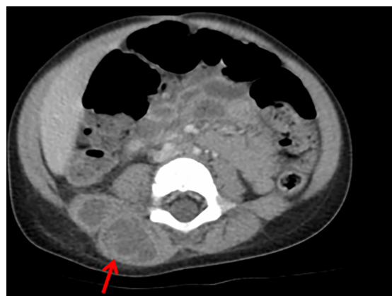
Image 1. Axial computed tomography of the lumbar spine revealing areas of low density with some rim enhancement in the right posterior paraspinal muscles (arrow) consistent with abscess.

A two-year-old female born at term with no known medical history presented to the emergency department (ED) with her family complaining of fevers, right lower back pain, and abdominal pain for six days. The patient's parents reported decreased oral intake, fussiness, and increased refusal to ambulate. Vitals were significant for a heart rate of 145 beats per minute and temperature of 39.8 degrees Celsius (103.6° Fahrenheit). Physical examination was positive for a fussy,