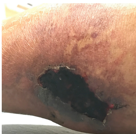
Image 1. Physical examination revealing lower extremity skin necrosis due to calciphylaxis in the setting of end-stage renal disease.

The findings were concerning for calciphylaxis. Punch biopsy showed extensive skin necrosis and calcifications confirming the diagnosis. The patient was treated with sodium thiosulfate and was discharged home but ultimately was transitioned to hospice care.