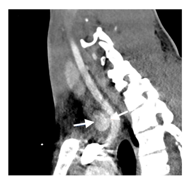
Image 1. Sagittal multiplanar reconstruction of the computed tomography angiogram of the head and neck demonstrates a 1.8 cm amorphous, hyperdense, oval structure abutting the anterior aspect of the junction of the brachiocephalic and right common carotid arteries, with an apparent connecting neck extending from the brachiocephalic artery (arrows), suggesting a pseudoaneurysm or contained rupture.

At that time the patient was identified as a suspected stroke with a National Institute of Health Stroke Scale score of three. Pediatric neurology was consulted, and the patient was emergently taken for computed tomography (CT) head, CT cervical spine, and CT angiogram (CTA) of the head and neck. Computed tomography did not demonstrate any acute intracranial abnormality or fracture of the cervical spine. The CTA of the head and neck showed "a 1.8 cm amorphous hyperdensity abutting the anterior aspect of the junction of the brachiocephalic and right common carotid arteries with an apparent neck extending from the brachiocephalic artery, suggesting pseudoaneurysm or contained rupture" (Image 1).