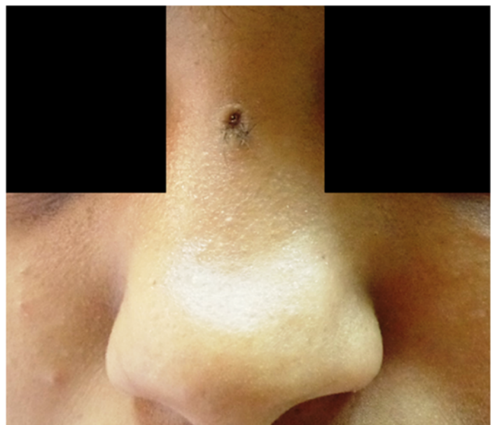
Figure 1: Trichofolliculoma. A skin-colored papule on the nose with a central umbilication and small protruding hairs.

Trichofolliculoma is a rare hair follicle hamartoma/tumor. It is considered by most authors to be a hamartoma rather than a neoplasm as it has all components of the hair follicle in an aberrant distribution [4]. Its differentiation is midway between a hair follicle nevus and a trichoepithelioma [5]. It usually presents in adulthood as a single lesion on the face especially around the nose. However, it is reported to occur in other sites such as the external auditory meatus, intranasal area, genitalia, lip, and vulva [6]. Rare cases of congenital trichofolliculoma have been reported in the literature [7-11]. There are