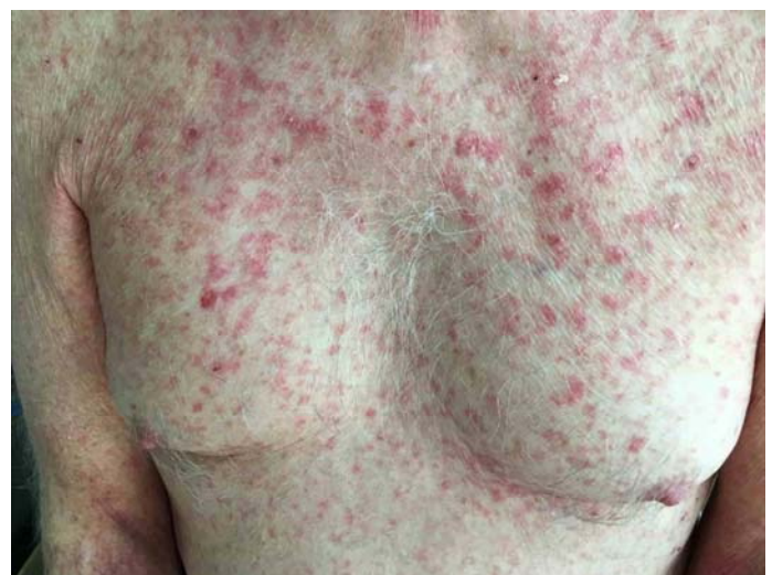
Figure 1. Clinical image of rash due to enfortumab vedotin. Erythematous, scaly, pruritic papules on the chest and upper abdomen in a patient treated with enfortumab vedotin for metastatic urothelial carcinoma. Similar lesions were present on the back and extremities.

A man in his 70s with a history of metastatic urothelial carcinoma involving the right ureter, lymph nodes, and lungs presented to outpatient dermatology clinic for evaluation of a scaly, pruritic rash involving the torso and extremities. Two weeks prior to presentation he received an infusion of enfortumab vedotin as part of a phase I clinical trial. He subsequently developed the eruption within days of his first dose and noted minimal improvement with triamcinolone 0.1% cream. Of note, the patient was previously on a clinical trial of pembrolizumab, which was discontinued two