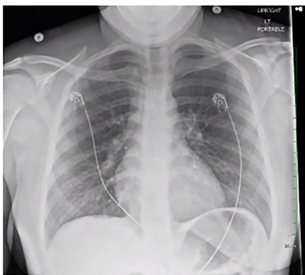
Image 2. Portable upright anterior-posterior chest radiograph not demonstrating appreciable cardiopulmonary disease.

cm interventricular septal mass just below the aortic valve. The patient was subsequently transferred to a tertiary medical center for cardiothoracic surgical evaluation.