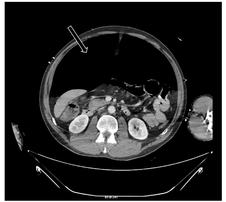
Image 2. Computed tomography of the abdomen with intravenous contrast at the level of the inferior tip of the liver and kidneys showing large pneumoperitoneum, as noted by arrow, with tension physiology.