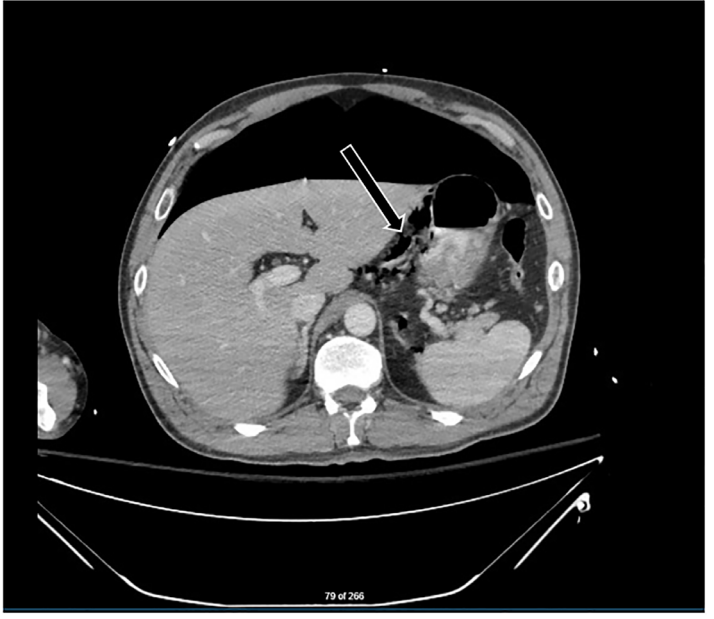
Image 3. Computed tomography of the abdomen and pelvis with oral contrast at the level of the stomach performed after needle decompression. Large pneumoperitoneum was still present but without tension. Arrow points to air bubbles seen along lesser gastric curvature suggesting location of perforation.

With the patient stabilized, the general surgeon requested a CT of the abdomen and pelvis with oral contrast for further localization of the injury. Due to concerns for perforation, the decision was made to not advance the previously short OG tube any farther but to continue to use it to instill watersoluble contrast into the gastrointestinal tract. While the repeat imaging was not definitive, the likely site of viscous perforation was thought to be the lesser curvature of the stomach (Image 3).