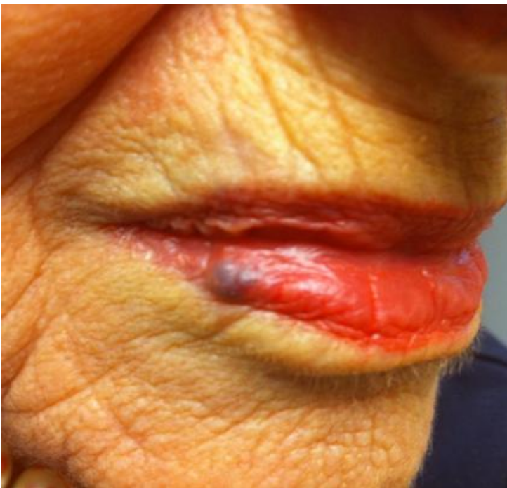
Figure 2A. 78 year-old woman prior to treatment of venous lake on the lower vermilion lip.