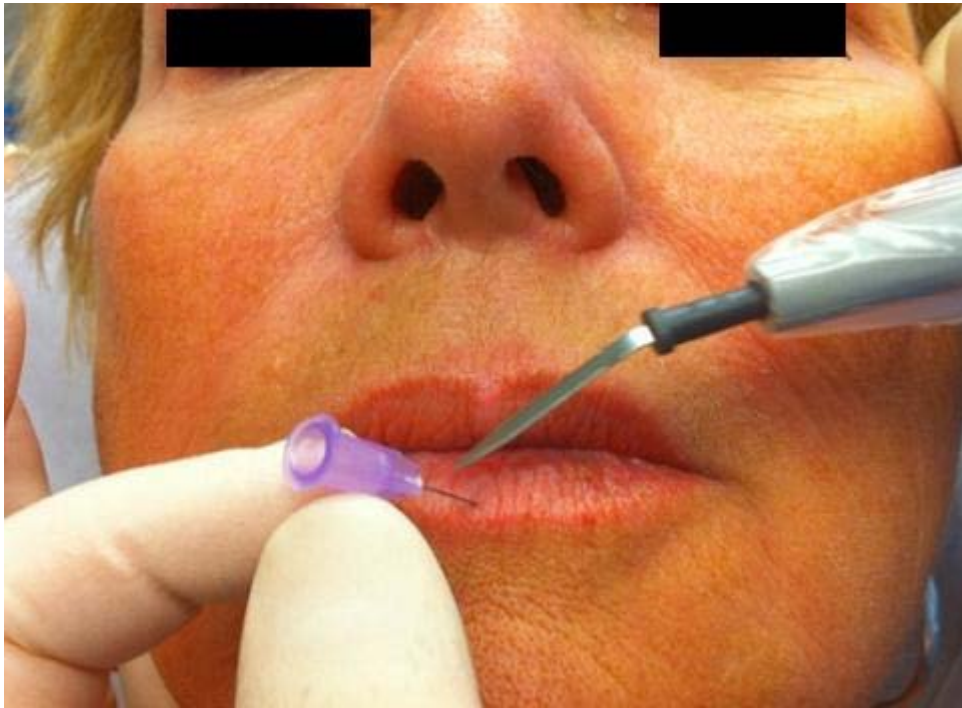
Figure 1. The venous lake is desiccated by conducting electrical current intralesionally through the 30 gauge needle.

levels of the venous lake. In order to avoid damage to the superficial mucosa, it is important to discontinue delivering current prior to complete withdrawal of the needle.