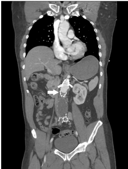
Image 2. Coronal view of abdominal computed tomography angiography demonstrating contrast reaching but not flowing past the site of occlusion at the aortic endograft (arrow).