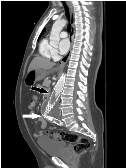
Image 3. Sagittal view of abdominal computed tomography angiography demonstrating kinking of the aortic endograft (white arrow) and the presence of contrast having reached the location of the thrombus (black arrow) within the endograft.

which can result in acute limb ischemia. 1,2 Bilateral leg ischemia due to endograft occlusion is rare with a reported incidence ranging from 0%-0.6%. 3